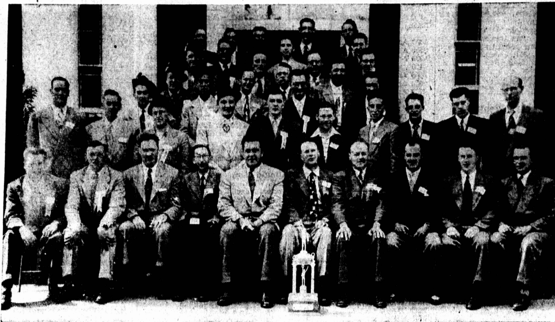
Picture taken Friday, June 22, Charlottetown Hotel, before new election of officers.