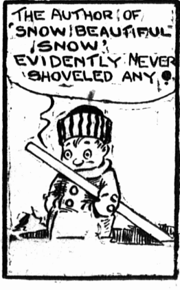
THE AUTHOR OF 'SNOW BEAUTIFUL IS NOW! EVIDENTLY NEVER SHOVELED ANY.'