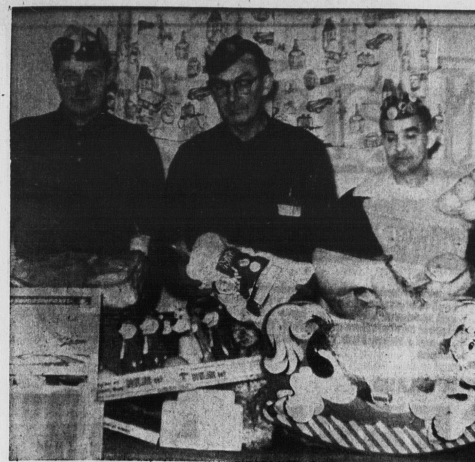
PARKDALE LIONS SPREAD CHRISTMAS CHEER - Santa Claus really came on town yesterday for many happy kids as the Christmas Eve deliveries of the Parkdale Lions' Christmas Day project were made on time to all.