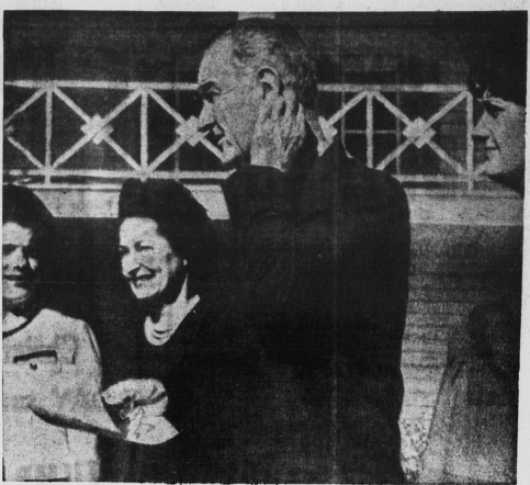
President Lyndon B. Johnson, left, and Mrs. Johnson, right, with their family, are seen at a Christmas dinner at the White House.