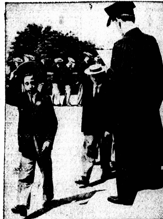
SCHOOLMASTER IS KING - Who is taking off whose hat to whom? King Feisal of Iraq, a pupil in Harrow School, Middlesex, England, raises his hat to the headmaster at the roll call parade of the Speech Day ceremony. It was the first time since World War II that the wearing of hats at this function was compulsory.