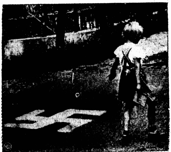
SWASTIKA RETURNS - The swastika, symbol of tyranny in Nazi Germany, has been making mysterious reappearances in the streets of Vlotho, Germany, where a number of high-ranking British military officials live. The child above is seen playing near one of the symbols, which German workers had to eradicate with liquid tar.