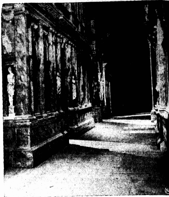
The street scene, above, is said distance. The all-wooden theater to be one of the most perfect it was designed by Vincenzo Scamozzi in the make-believe world, and is in nearly perfect condition of the theater. Constructed of lion after 370 years. The Teatro wood in 1882, it is set up in the present patrons fear that "Teatro Olimpico," in Vicenza, stant use of the building would Italy. Actually less than 10 feet in damage it, and it is opened for depth, to the audience it appears one "run" only three weeks each to stretch 30 or 40 feet into the year.