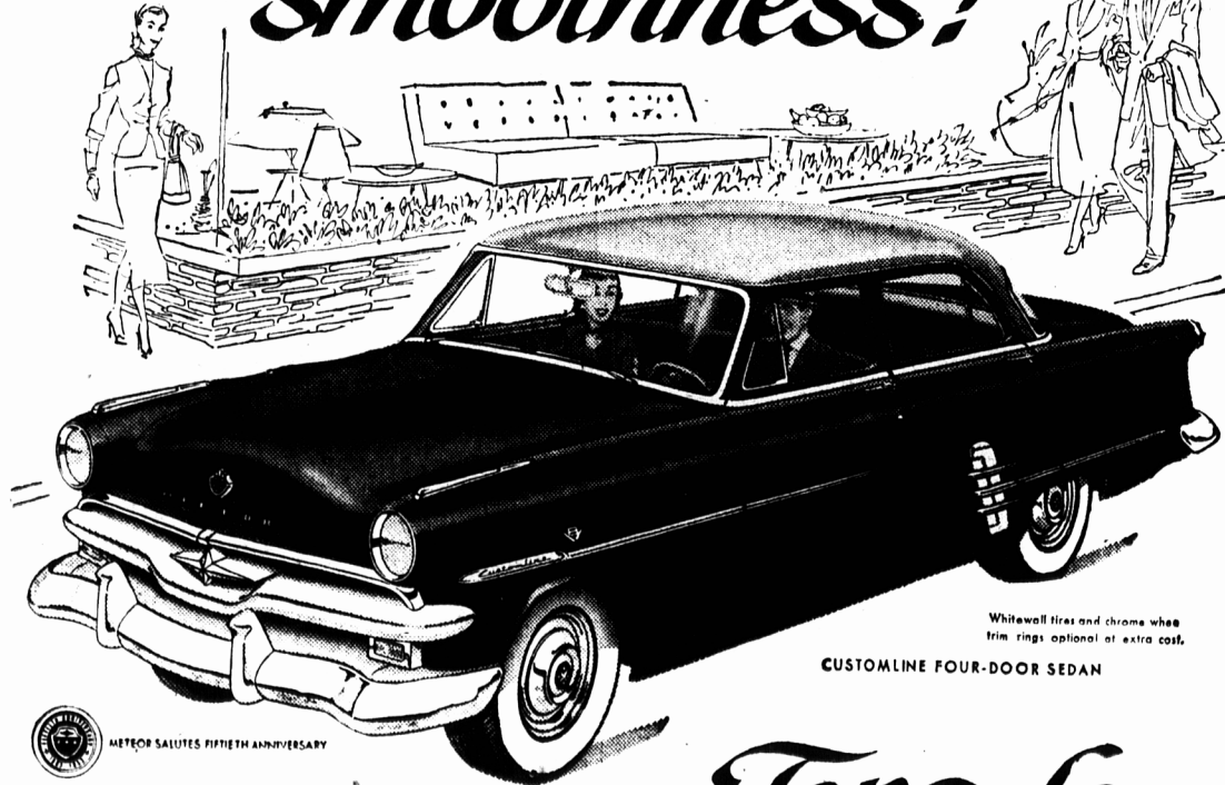
White wall tires and chrome wheel trim rings optional at extra cost. CUSTOMLINE FOUR-DOOR SEDAN