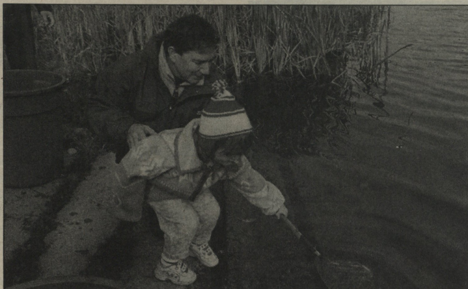
The Pat Binns.

Pat Mella, PEI's Provincial Treasurer, supported Lantz's announcement. "We all know that university education's purpose should be to make young people employable," said Mella, "but we also know that in today's economic climate, people with bachelor's degrees are working in fast food restaurants and convenience stores. So why not