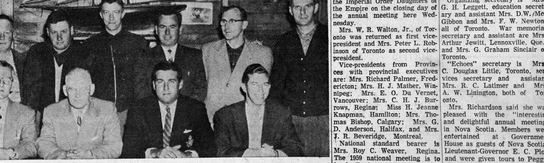
YACHT CLUB ELECTS OFFICERS