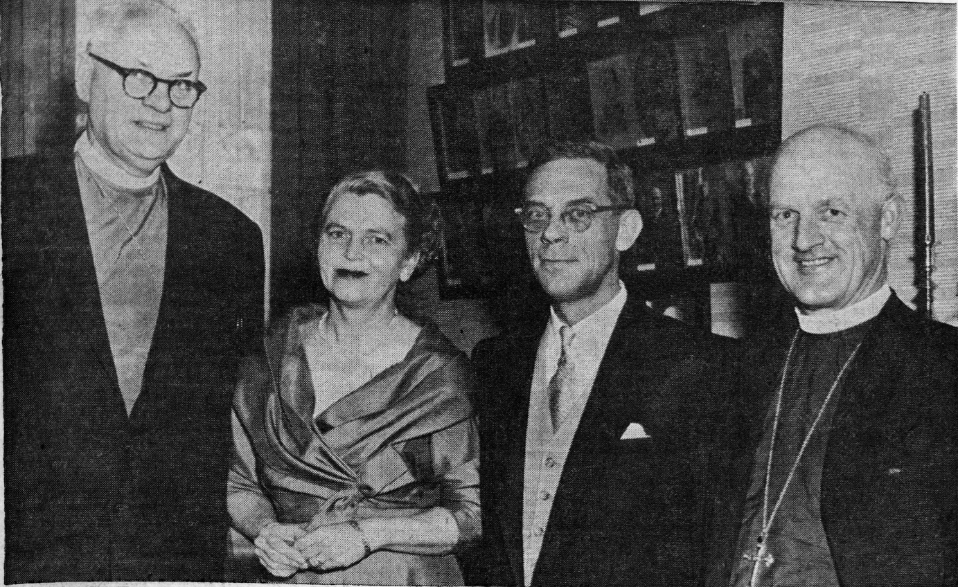
HONORED GUESTS AT AFTERNOON TEA