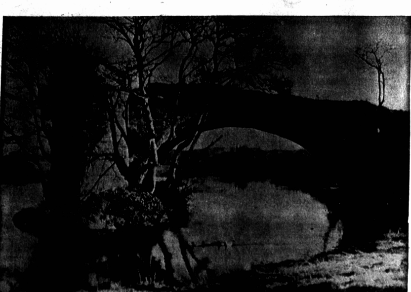
The remains of the old Bridge of Earn, Perthshire