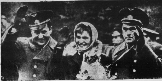
COSMONAUTS ON SIDELINES

Russian cosmonauts Pavel Popovich, and Valentina Andrian Nikolayev, left to right, are shown on the sideline watching Thursday's parade in Moscow's Red Square on the 46th anniversary of the Bolshevik Revolution. Valentina Andrian were recently married. This photo is from Novosti, Russian photo agency.