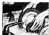
Use TUFFY on red flange—in place of dishes or mops.

Tuffy is the modern, quick way to clean sticky, gummy, crusted foods from dishes, silverware, pots and pans. Tuffy is a new non-metallic "wonder-mesh" that is immensely strong and long lasting yet won't harm fine china or silverware. Kind to your hands, Tuffy rinses clean under the tap, stays clean and sweet-smelling after long use.