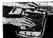
Use TUFFY on baking dishes, mixing bowls.