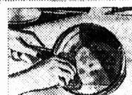
Use TUFFY to scrub away messy foods, scrambled eggs, hot cereals.