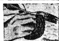
Use TUFFY on sticky silverware. Wipes away stuck-on egg—foods that cling.