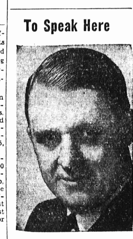
Hon. Douglas Abbott (above), Minister of Finance, Ottawa, who is scheduled to address the annual meeting of the Maritime Provinces Board of Trade at a dinner function in Charlottetown on October 8.