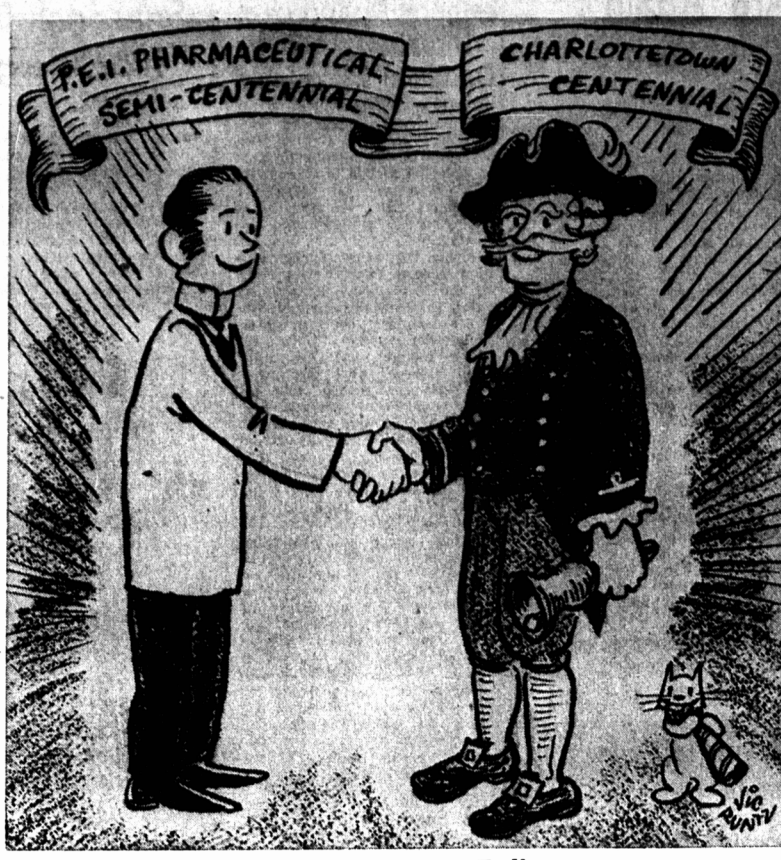
A Fine Young Fellow

Supporters of the single transferable vote, or alternative vote system, argue that the simple ballot used in federal elections and in other provinces may not reflect the true wishes of a majority of voters in constituencies with more than two candidates.