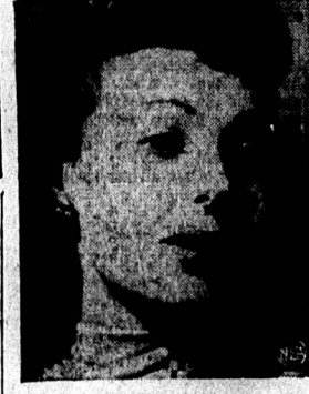
LORETTA YOUNG for "Come to the Stable"