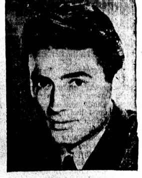
GREGORY PECK for "Twelve O'Clock High"