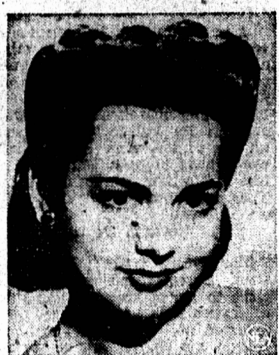
OLIVIA DE HAVILLAND for "The Heiress"