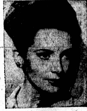
DEBORAH KERR for "Edward, My Son"