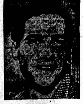
RICHARD TODD for "The Hasty Heart"