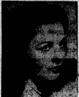
JEANNE CRAIN for "Pinky"

Here are the 16 nominees for the two top acting awards of the Academy of Motion Picture Arts and Sciences. The best actor and best actress for 1949 will receive the Academy's gold "Oscar" statuettes. Winners will be announced in Hollywood, March 23.