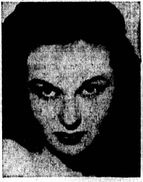
SUSAN HAYWARD for "My Foolish Heart"