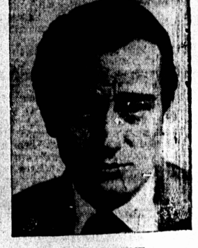
JOHN WAYNE for "Sands of Iwo Jima"