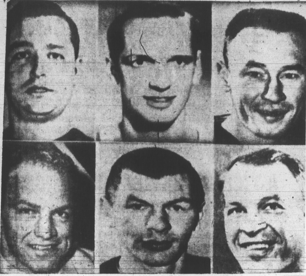
THIS IS the first all star team chosen by sports writers and sportscasters in the six National Hockey League Cities. AT TOP LEFT TO RIGHT are Glen Hall, Jacques LaPerriere and Pierre Pilote, while AT BOTTOM FROM LEFT TO RIGHT are Bobby Hull, Stan Mikita and Gordie Howe.

MONTREAL (CP) — Chicago Black Hawks, who this season again missed their perennial quest for first place and were knocked out in the Stanley Cup semi-finals, have won their share of National Hockey League stardom for 1965-66. The Hawks, led by left winger Bobby Hull, won four of the six positions on the NHL's first all-star team, announced Thursday. They also took one spot on the second team. The teams, with points in brackets: First team: Goal — Glenn Hall, Chicago (144); Defence — Jacques Laperriere, Montreal (119); Pierre Pilote, Chicago (102); Centre — Stan Mikita, Chicago (100); Left wing — Hull, Chicago (180); Right wing — Gordie Howe, Detroit (160). Second team: Goal — Lorne Worsley, Montreal (85); Defence — Allan Stanley, Toronto (77); Pat Stapleton, Chicago (69); Centre — Jean Beliveau, Montreal (89); Left wing — Frank Mahovlich, Toronto (59); Right wing — Bobby Rousseau, Montreal (113).