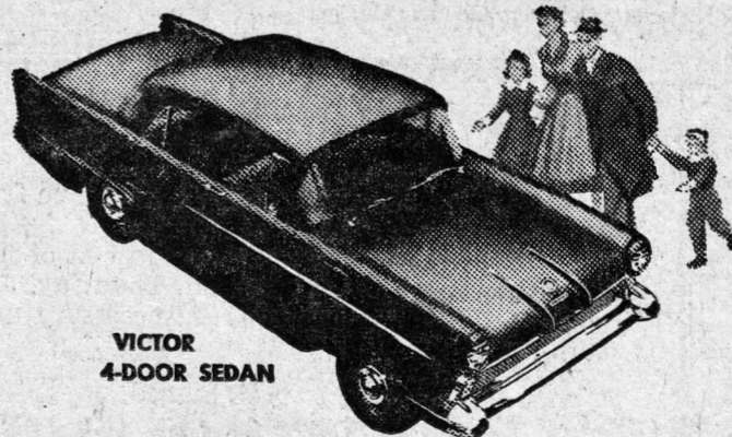
VICTOR 4-DOOR SEDAN

You get so many features as standard equipment that you expect only in luxury cars, as well as amazing sports car handling and the finest of modern styling. Yet look at Victor's price... it makes it easy to own this fascinating family car. See your Victor dealer — now!