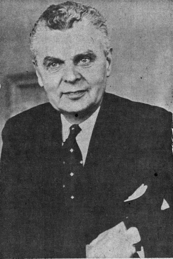
The Rt. Hon. John Diefenbaker