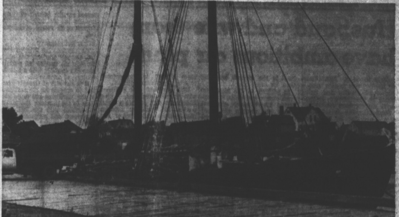
SHIPPING FROM THE MARINE SLIP IN GEORGETOWN WAS BRISK DURING 1961