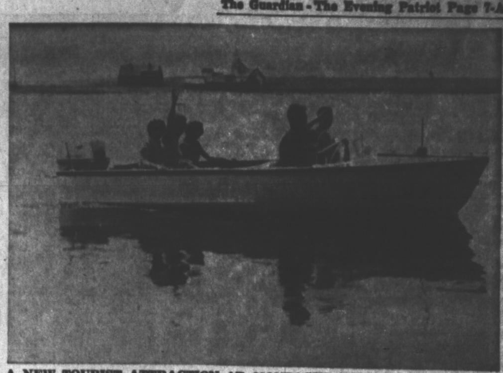
A NEW TOURIST ATTRACTION AT MONTAGUE WILL BE BOAT TOURS