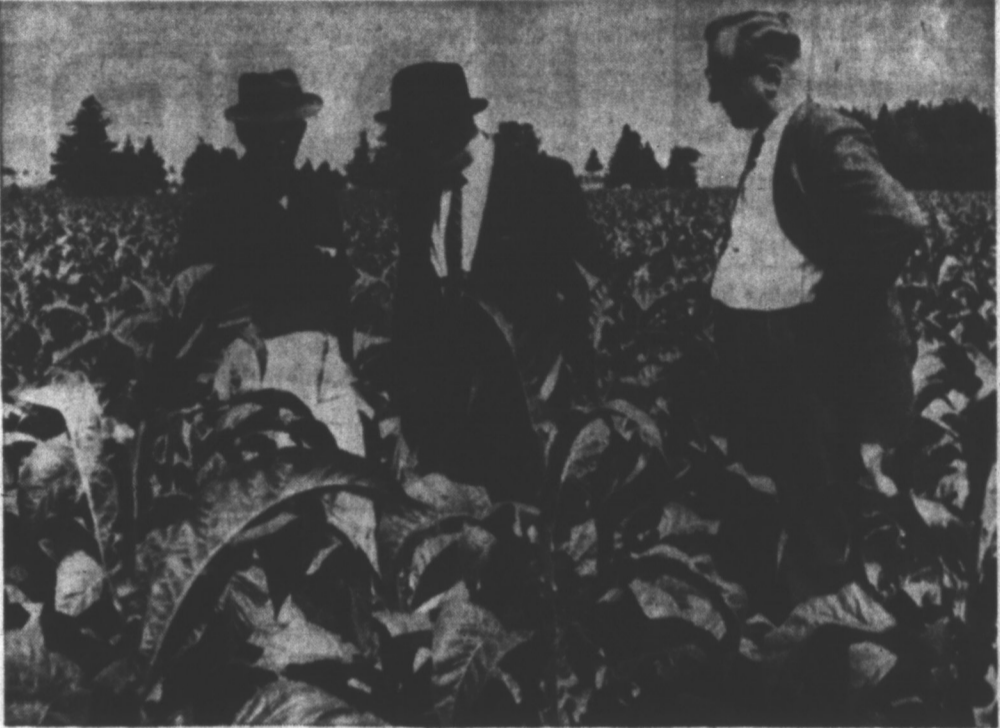
MONTAGUE EXPECTS FUTURE BOOST FROM TOBACCO CROP