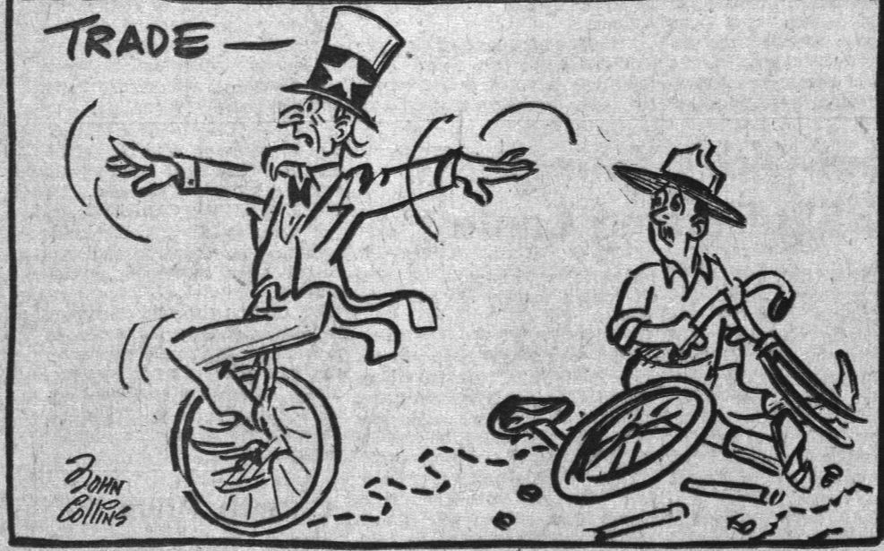
THE BICYCLE BUILT FOR TWO