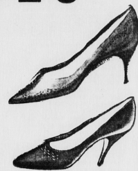
NOT EXACTLY AS ILLUSTRATED