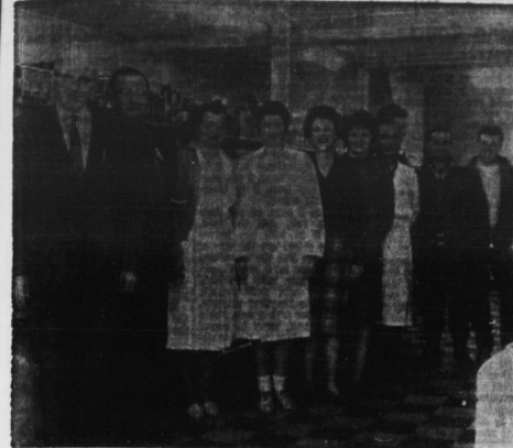
LARGE, TRAINED STAFF IS AVAILABLE TO SERVE CUSTOMERS