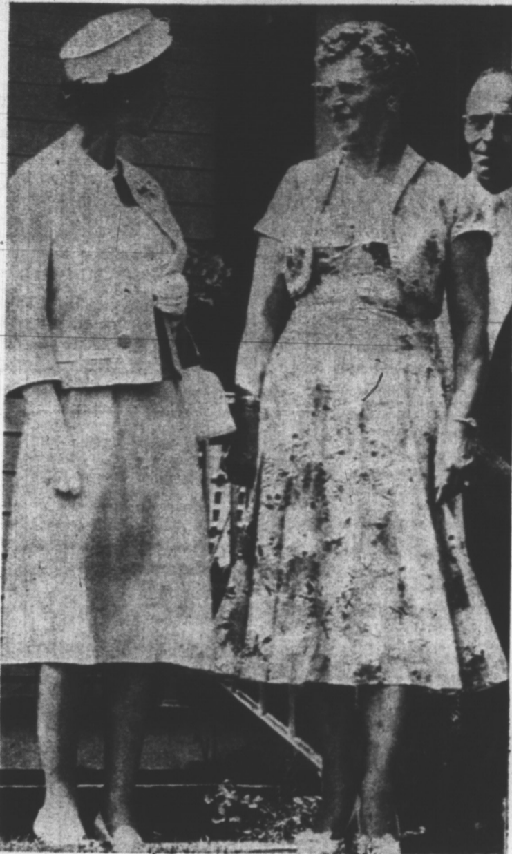
AND SOME 'WOMAN TO WOMAN'