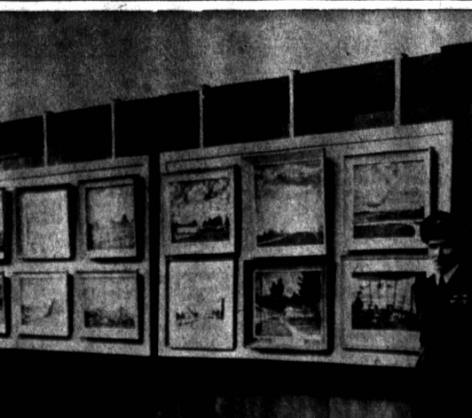
R.C.A.F. Paintings At Civic Centre

Reserve Feb. 24th for European Travelogue. Sponsored by Notre Dame Centennial Committee. North River Rink to-night, Milton Hornets vs. Covehead Redwings. Game time 8.30. Skate after. Carnival Thursday, Feb. 16. Bingo St. Peter's Holy Name Hall Thursday, Feb. 16th at 8 p.m. and every Thursday during Winter. 15 cash prizes. Two Freeze out Jack Pot $25. Admission 35 cents. Sponsored by the C. W. L. Crapaud Rink, skating 8 to 10. Thursday night. Skating game in semi-finals. Crapaud Victoria Board of Trade League, Nine Mile Creek Buildings vs. Albany St. Pats. Game starts 8.30 sharp. Team holding up game will be penalized. Skate after. Carnival February 24.