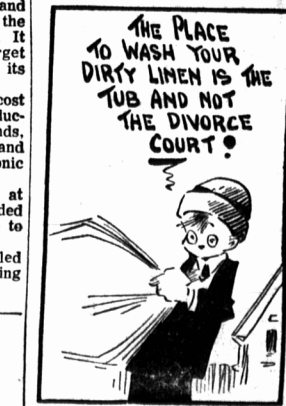
THE PLACE TO WASH YOUR DIRTY LINEN IS THE TUB AND NOT THE DIVORCE COURT!

High tide today at Charlottetown at 0.48 a.m. and 1.11 p.m. Sun rises at 7.15 a.m. and sets at 5.39 p.m.