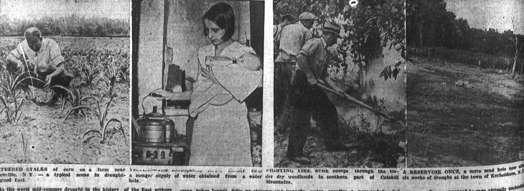
WITHERED STALKS of corn on a farm near Ellenville, N.Y.—a typical scene in drought-stricken areas. A meager supply of water obtained from a water hole. FIGHTING FIRE, which sweeps through the timber reservoir once, a mere mud hole now dries dry woodlands in southern part of Catskill six weeks of drought at the town of Kerhonkson, N.Y. Mountains. As the worst mid-summer drought in the history of the East withers crops, bakes forests, dries up streams and imperils water supplies, a new and dreaded menace—fire—appeared to rage virtually unchecked in some of the woodland of New York state and New Jersey.