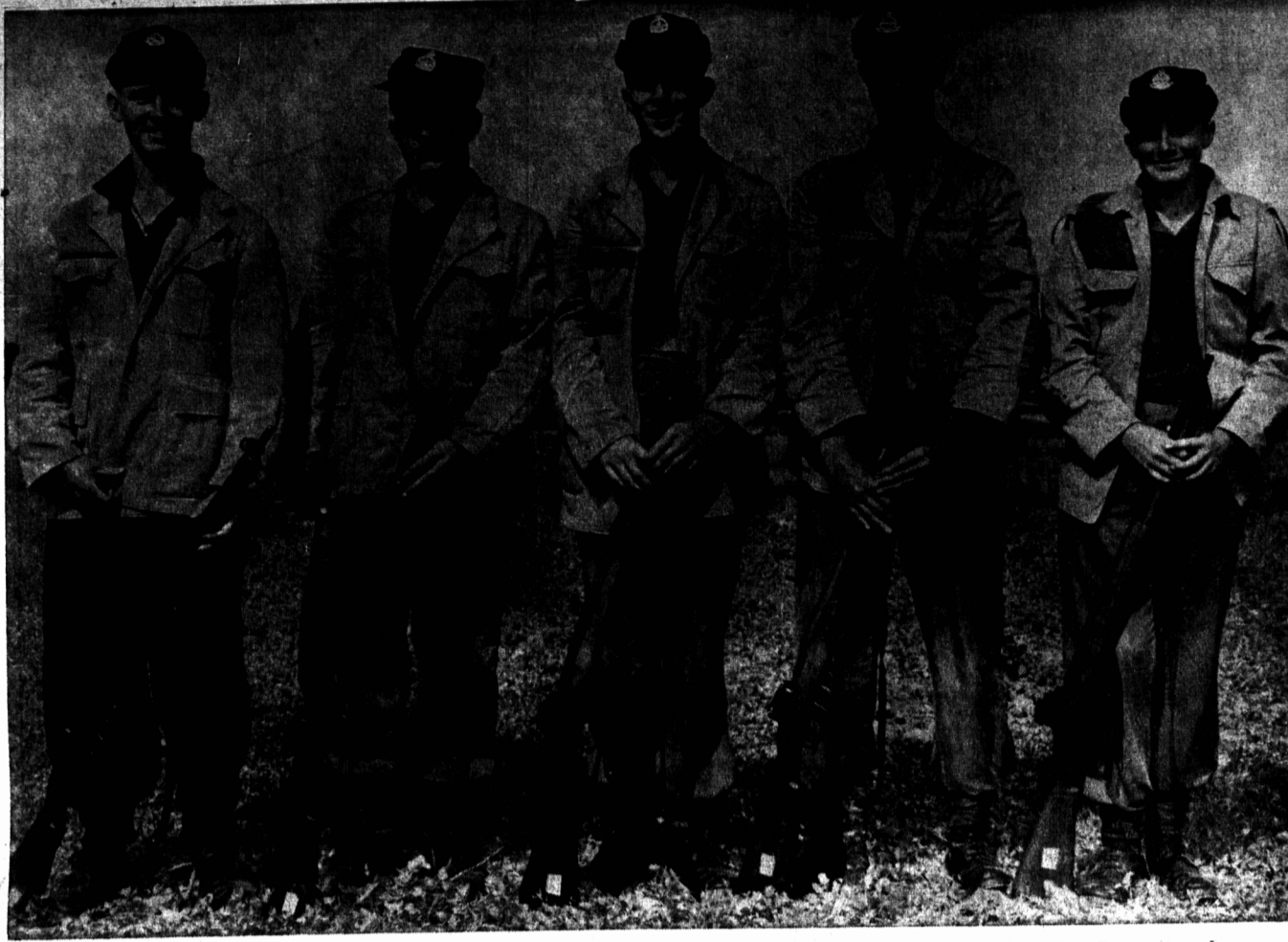
CADETS TAKE PART IN DOMINION SHOOT

The 20 Royal Canadian Army Cadets of the eastern Command Cadet Rifle Team left Camp Alder shot Friday morning by range for the Connaught Rifle Ranges at