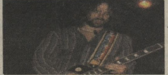
The Trews Interview page 10