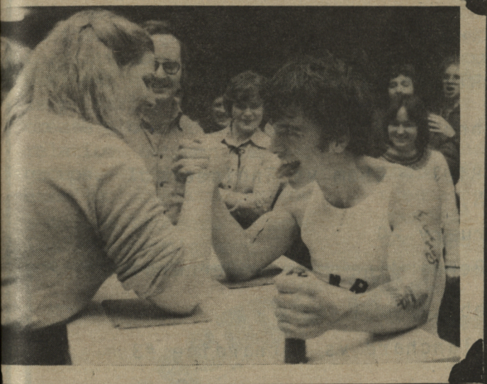
Rocky Vs. Wonder Woman