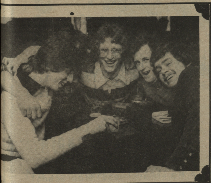
Hey Boys! We made the paper.