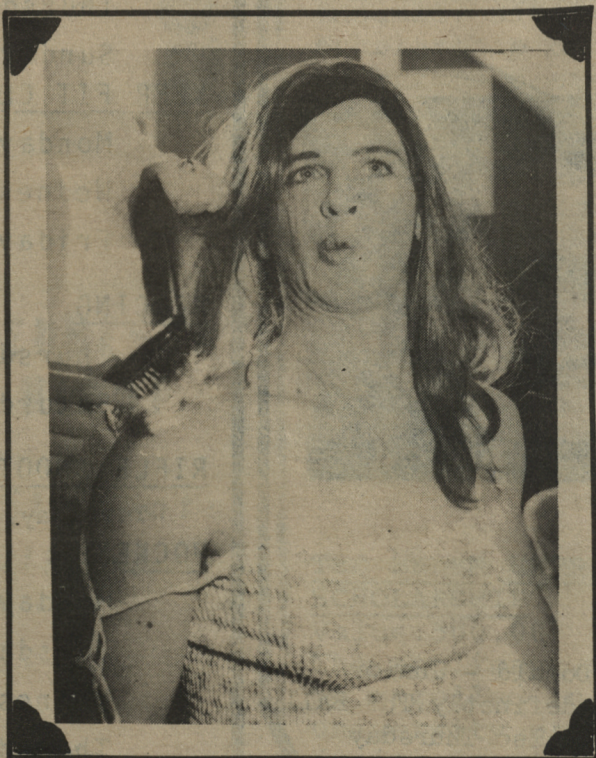
Oh! Them there frizzies.