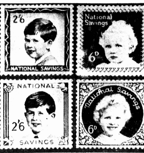
The new issues of National Savings stamps in Great Britain have portraits of Prince Charles and Princess Anne. They will go on sale in British post offices and savings banks from Nov. 1 on.