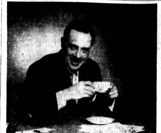
BUSY MAN ENJOYS TEA BREAK—Here's a man who has found a cup of Tea works wonders when the pressure mounts.

her column, not by mail or personal interview. Write to her in care of this newspaper.