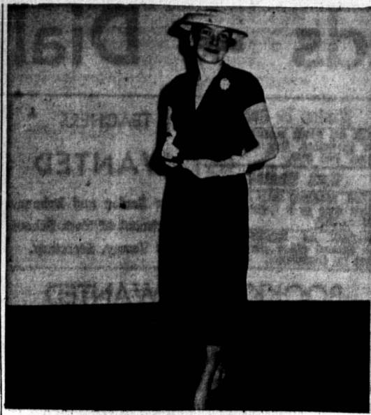
PRETTY PINK AND BLACK