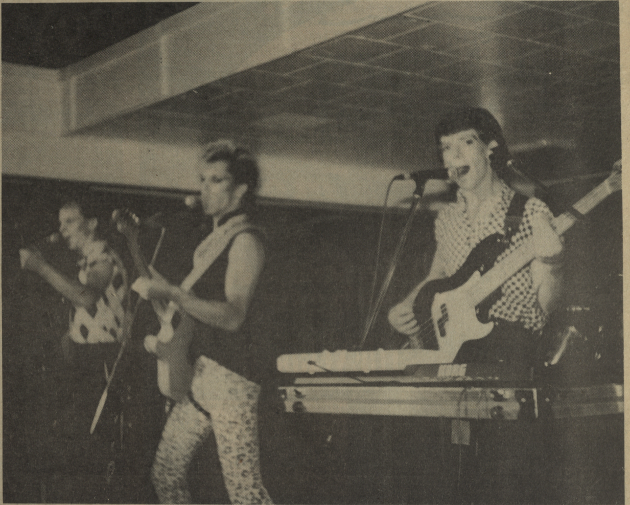
See Spot Run played on campus September 6 to a capacity crowd. Original songs, excellent equipment, and "a tight, high energy show", pleased listeners, according to reviewer Glen Boswell.

All in all it was a good evening for everyone. See Spot Run will likely be welcomed back next year.