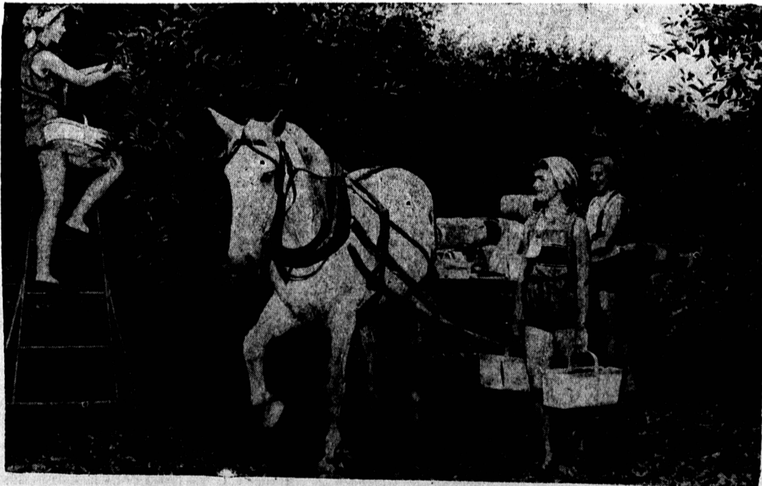
Farmerettes Earn Up to $8 a Day Picking Fruit in the Niagara Peninsula

On the Niagara peninsula fruit crops are ripening into one of the heaviest harvests on record. Fruit growers say prices should be low—providing, of course, the weather continues to be as good as it has been all season.