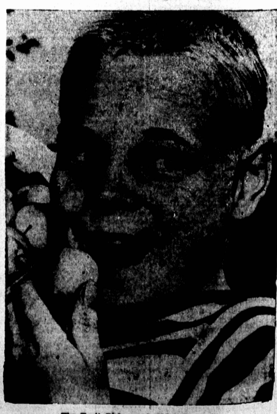
The Fruit Picker and Chief Consumer

On the Niagara peninsula fruit crops are ripening into one of the heaviest harvests on record. Fruit growers say prices should be low—providing, of course, the weather continues to be as good as it has been all season.