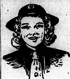
News From Our Lone Guides