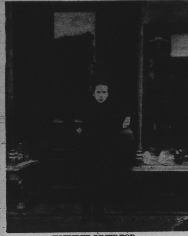
FOUNDER OF TIP TOP