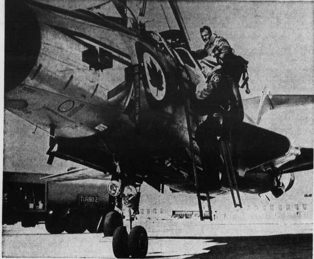
ISLAND IN DEFENCE ALERT A pilot and navigator climb aboard a CP-101B Voodoo twin-jet interceptor during an RCAF exercise. Canada has acquired five Voodoo squadrons, capable of carrying nuclear weapons, but no decision has been reached by the government on whether to equip the planes with nuclear warheads.