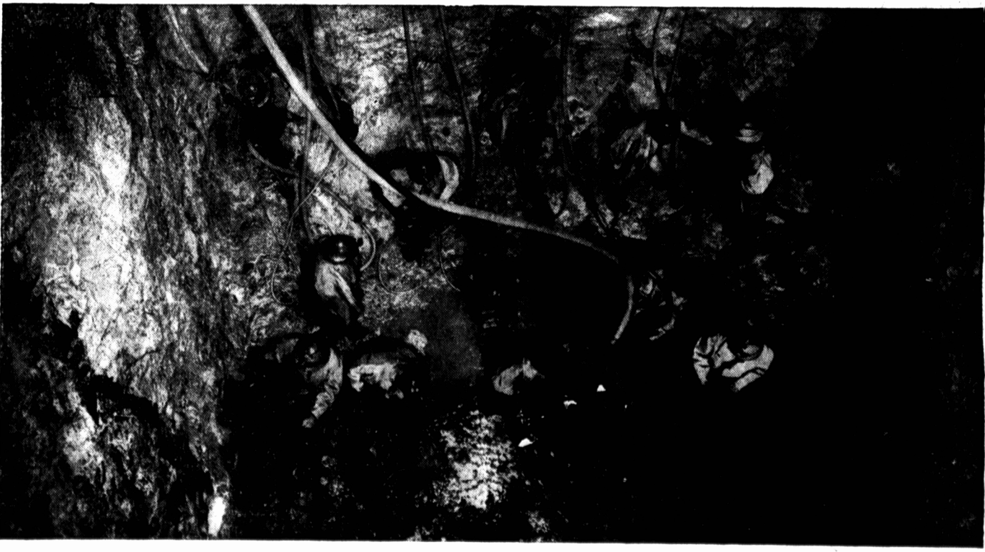
3. How an exploration shaft was sunk —This was the toughest job of all. Only a few men could work at a time. Their air-powered drills could drive only a few feet a day. After each blast, the shaft was scaled and shattered rock mucked out—long hours of work between each round of drilling.