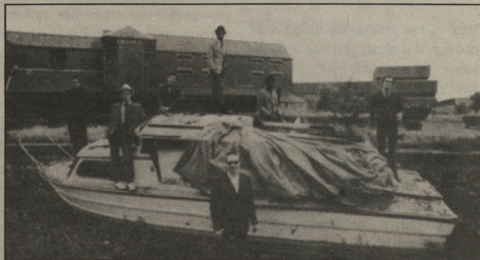
The Specials on their sinking ship.

Well it means that the good ska, the old ska will be less readily available. It will take more searching to find those early Specials singles or that rare Desmond Dekker 45. It means the creation of many New-Wave and Mod rock bands, which seems to be the flavor of the month. It means next time you wear a suit to a party people will think you just came from a funeral. It means the only music resembling ska you can expect to hear on the radio for a while will be on an ad for Jamaica.