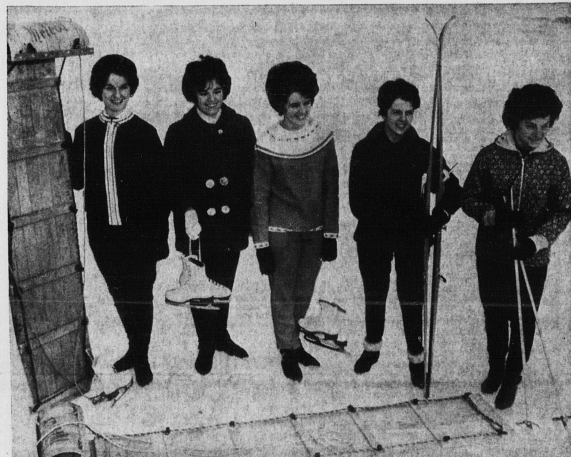
Five of the lovely six candidates for Queen of the Winter Carnival!

Torchlight Parade — Snow Sculpture Broomball, Bridge & Cribbage Tournaments Sleigh Ride, Carnival Queen Contest Dances, Carnival Ball, Snow Football Games Novelty Games and Races