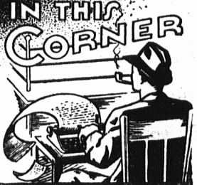
IN THIS CORNER

PAGE SIX THE GUARDIAN, CHARLOTTETOWN OCTOBER 4, 1952