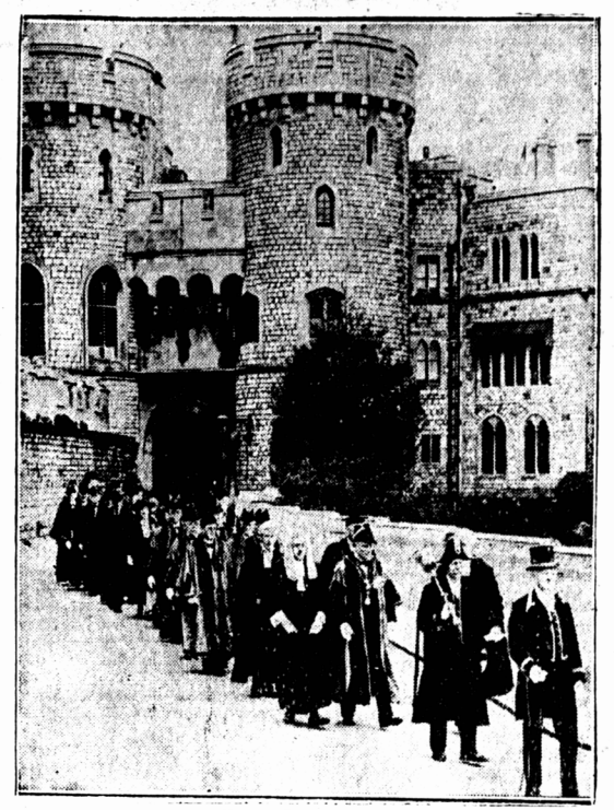
The mayor and corporation of the Royal Borough of Windsor, in their robes, with the dean and canons of St. George's chapel, walked in procession to Windsor Castle, to present the royal address to King Edward on his accession...