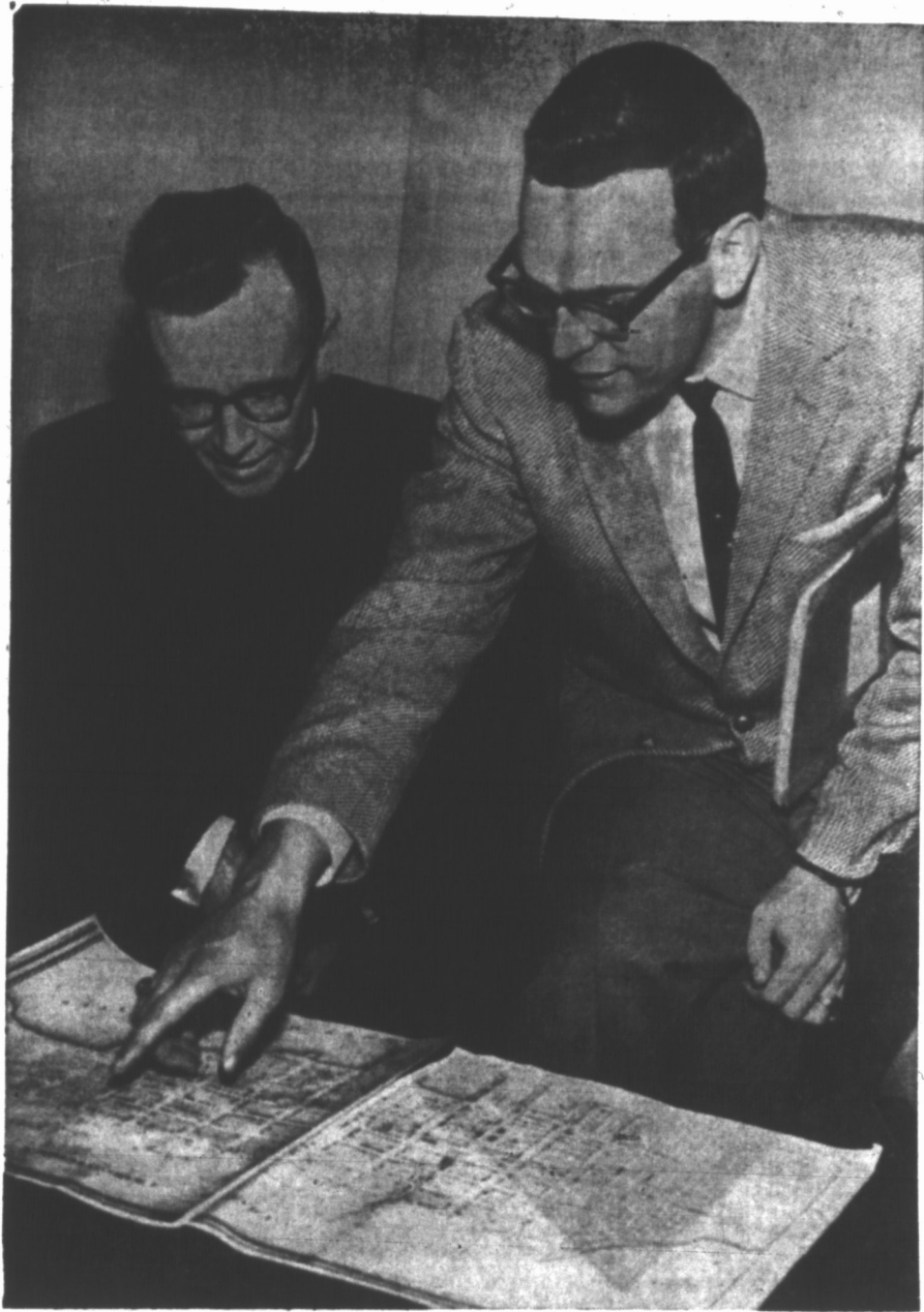
EXAMINE EARLY MAP OF CITY