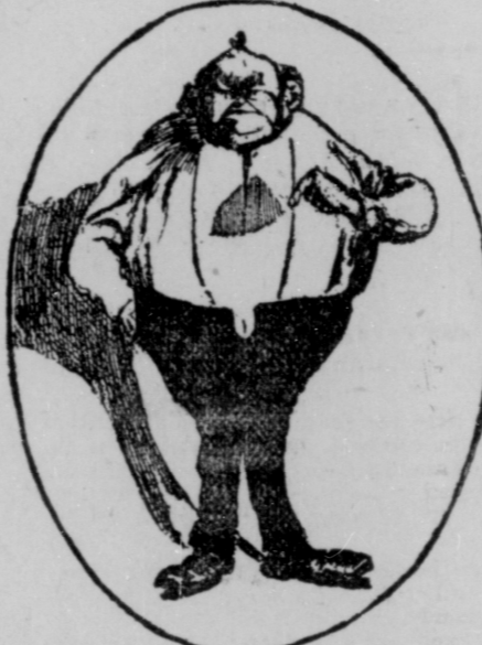
—New York World.

KEEP your blood pure and your stomach and digestive organs in a healthy condition by taking Hood's Sarsaparilla and you will be WELL.