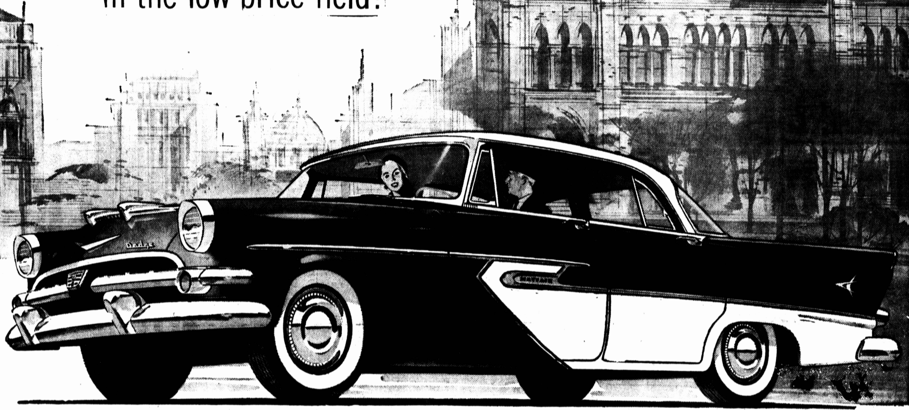
Dodge Mayfair V-8, 4-door Sedan