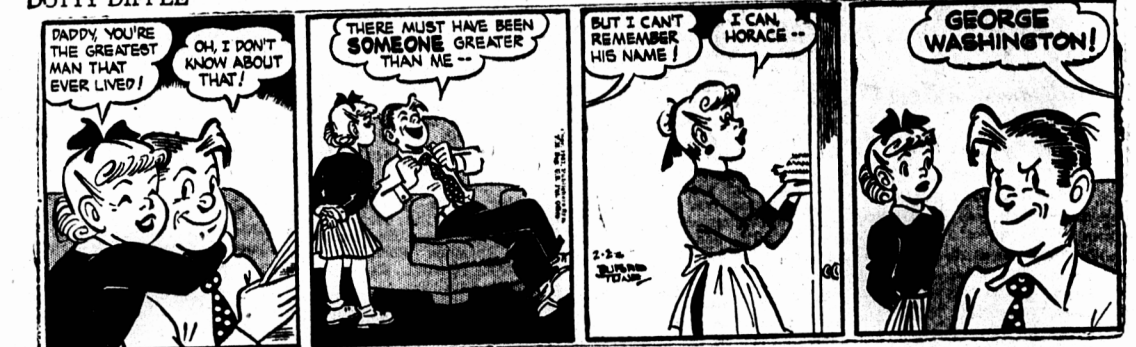
DOTTY DIPPLE By Rufora