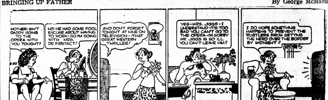
BRINGING UP FATHER By George McManus