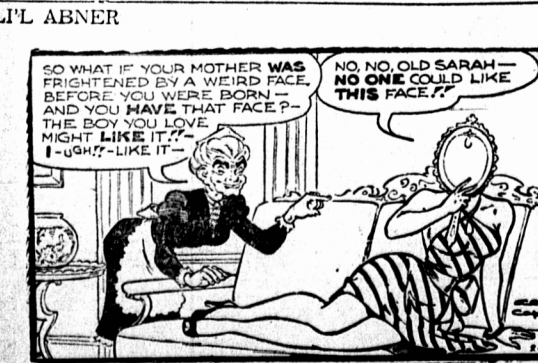
L'L ABNER By Al Capp