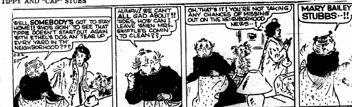
TIPPY AND "CAP" STUBS By Edwin