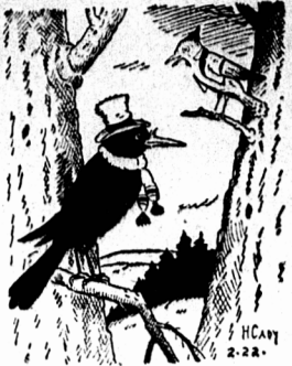
"Perhaps they are not going to have a nest," said Sammy Jay.

The next story: The Hootys Have Visitors.