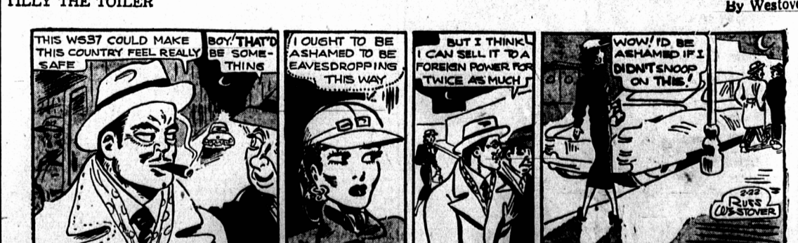
TILLY THE TOILER By Westover