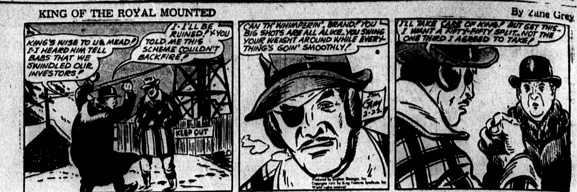
KING OF THE ROYAL MOUNTED By Lane Grey

The next story: The Hootys Have Visitors.