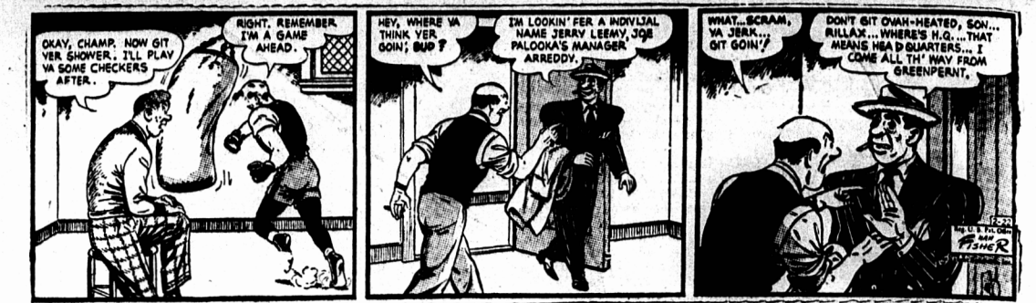
JOE PALOOKA By Ham Fisher