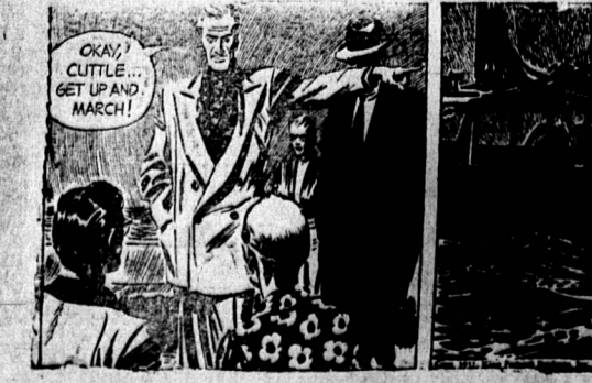
RIP KIRBY By Alex Raymond