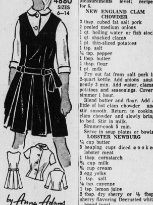
4880 SIZES 6-14