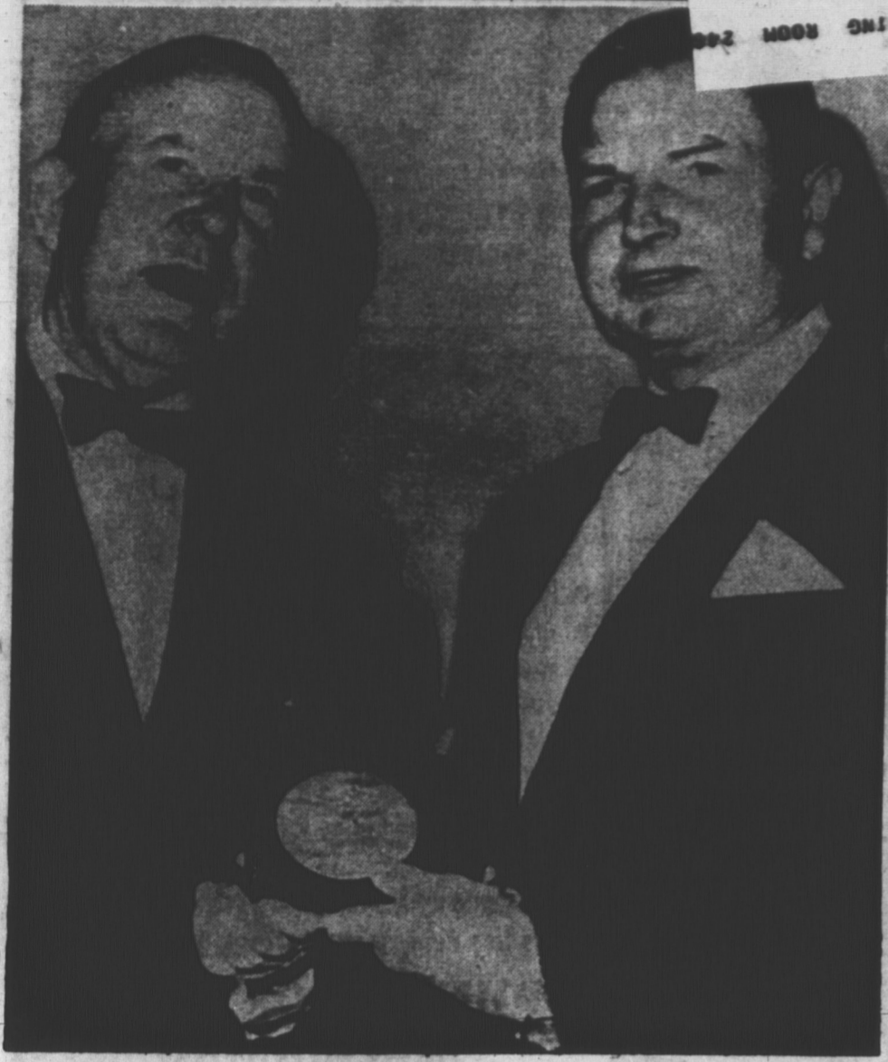
CANADIAN Prime Minister Lester B. Pearson, left, poses Wednesday night at the New