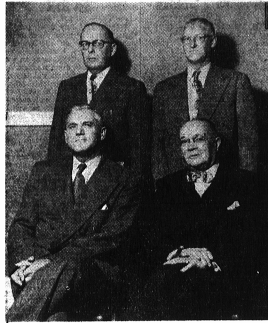
Pictured above are the chairmen of the General Public Campaign of the Prince County Hospital completion fund, photographed at the opening dinner on June 27th.