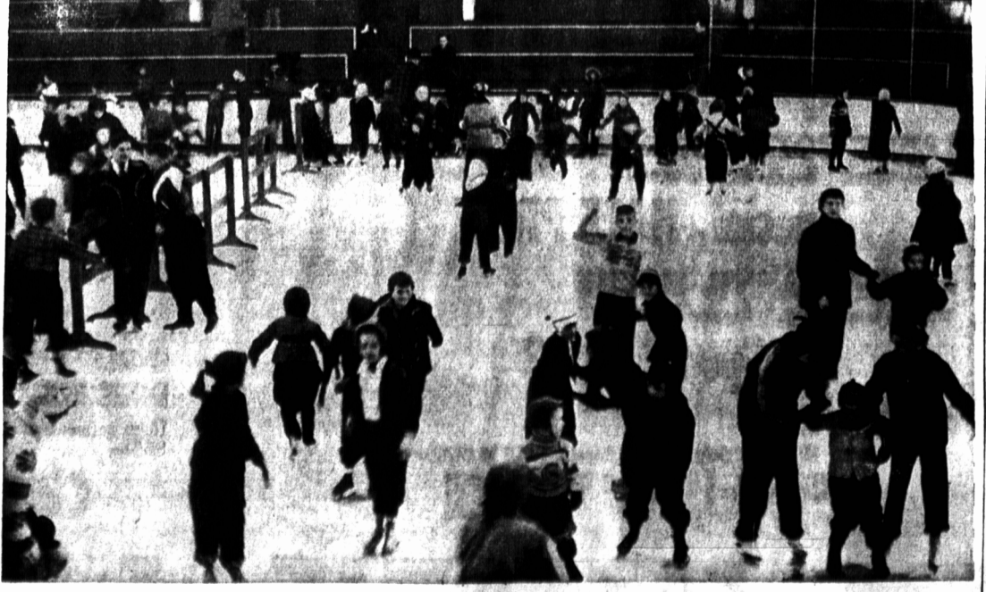
NEW INNOVATION FOR SKATING SESSIONS The management of the Sports Arena has devised another innovation to help out the tiny tots and all beginners who are on ice skates for the first time. Part of the area at the north end of the rink has been fenced off for the little ones and the more experienced skaters. In the near future the management hopes to allocate time to mothers and tots for a pre-school skate.