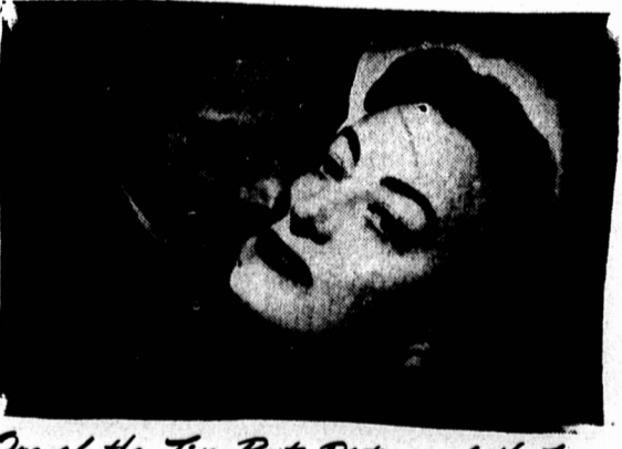
One of the Five Best Pictures of the Year

She had known hunger and security, too... and would stop at nothing to protect herself in the position she had reached. If you've known a woman of this kind, here is your opportunity to see her vividly dramatized in a magnificently conceived motion picture.