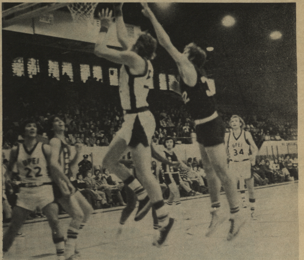
The playoffs - We won this battle but lost the war

ball Panthers were up to Newfoundland where they had a very pleasant sojourn & took two games from Memorial Beothuks. The games meant little as the playoff positions had already been determined.