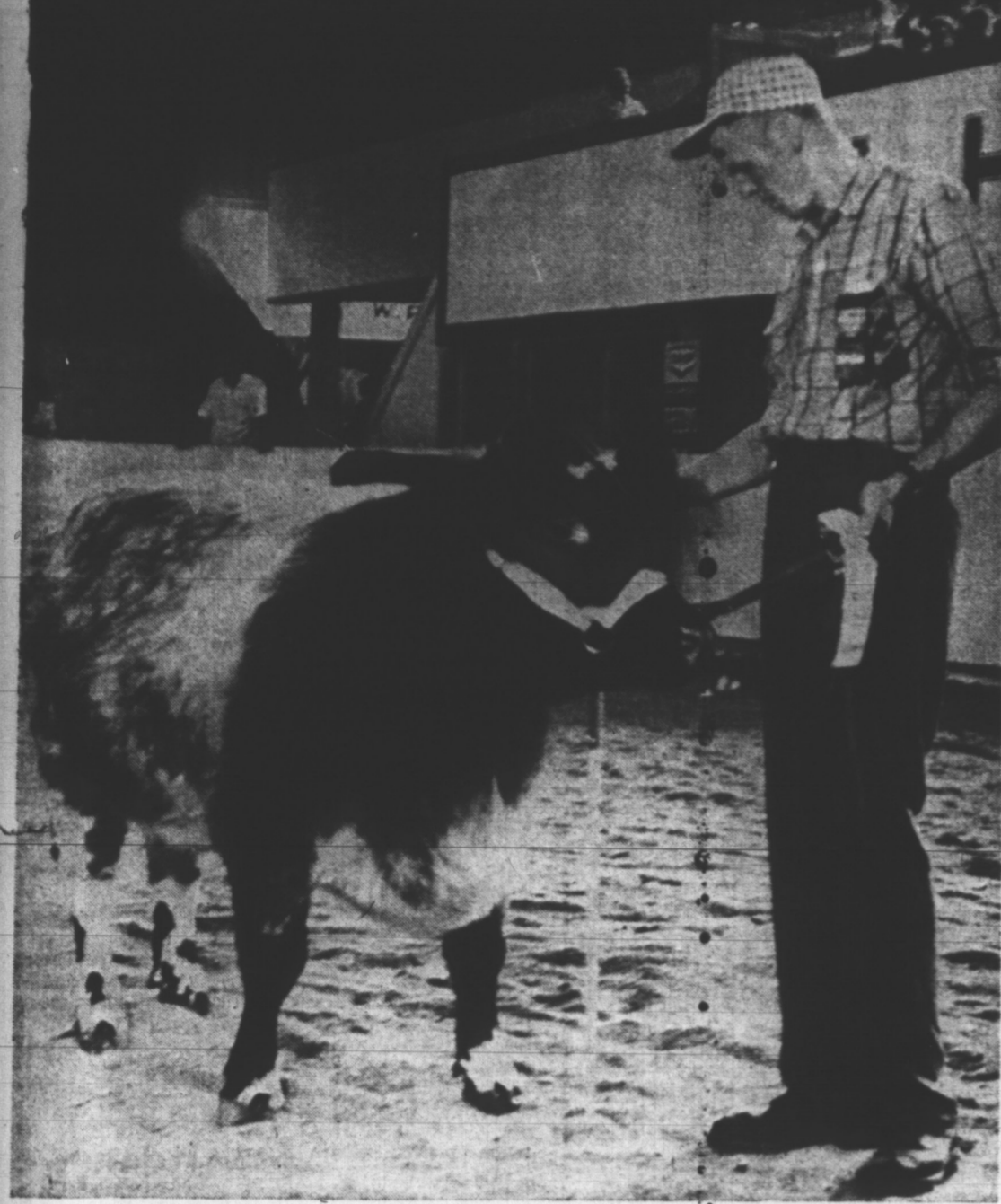
GRAND CHAMPION SHORTHORN FEMALE